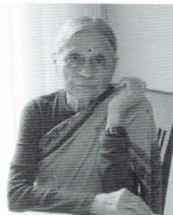
Ela Ramesh Bhatt

Ela Ramesh Bhatt, born in Ahmedabad in 1933 is an Indian co-operative organiser, activist and Gandhian who founded the Self Employed Women's Association of India (SEWA) in 1972, serving as its secretary until 1996. A lawyer by training Bhatt is part of the international labour, co-operative, women and micro finance movements and has won many awards. She was invited to become a member of 'The Elders' a group set up by Nelson Mandela on his 89th birthday to tackle some of the world's toughest problems