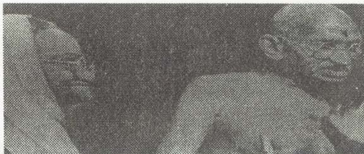
Kasturba Gandhi with the Mahatma

Yet, how many of us know of Kasturba except as she appeared to the public eye - a traditional yielding Hindu housewife. But what do we know of her as an individual? How did she cope with the demands that her