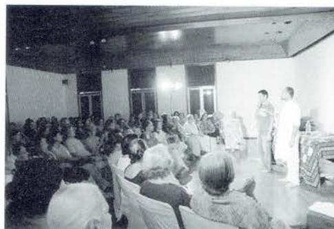
"General Meeting September 2006"